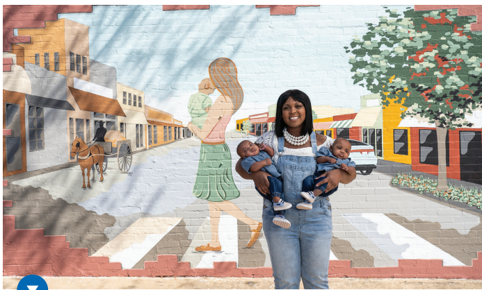
Murals sponsored by Methodist Mansfield brightened up the buildings in downtown Mansfield.